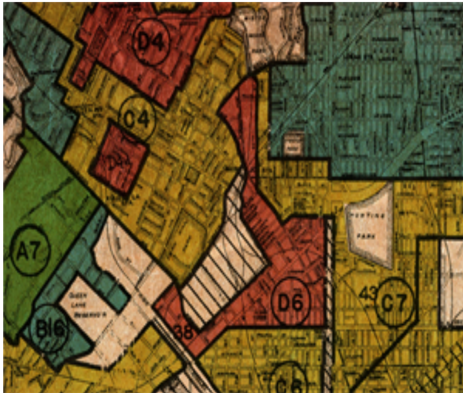
Camden, N.J. redlining Map