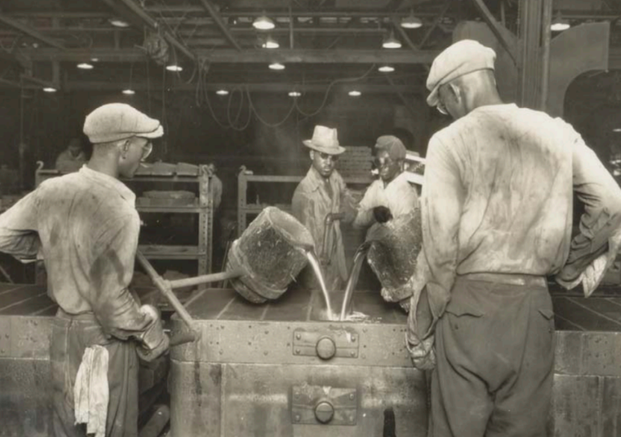
River Rouge Plant