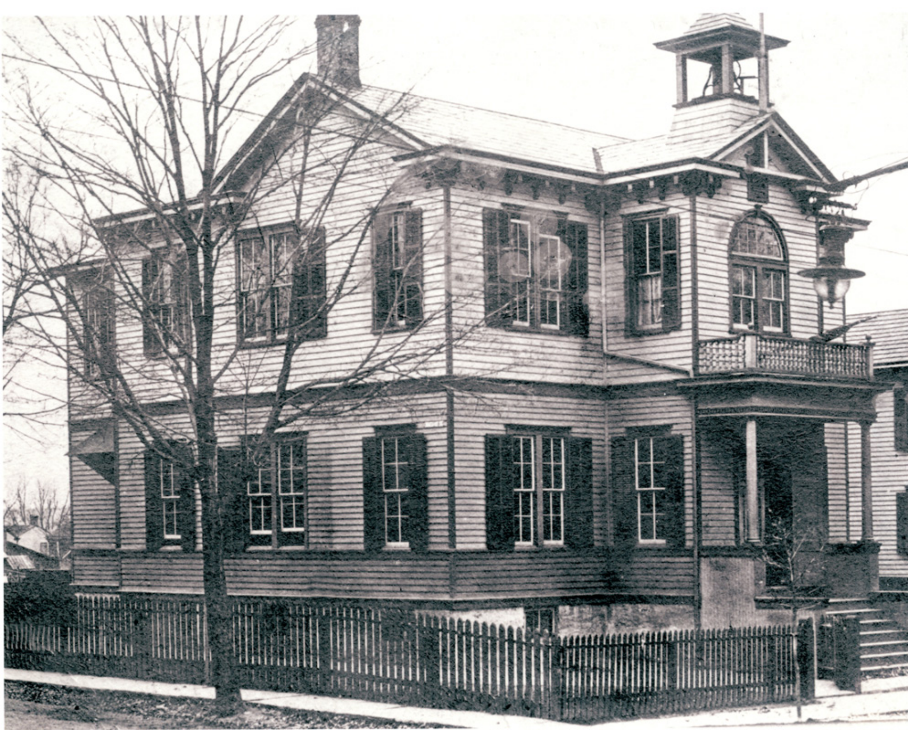
Princeton Quarry Street School