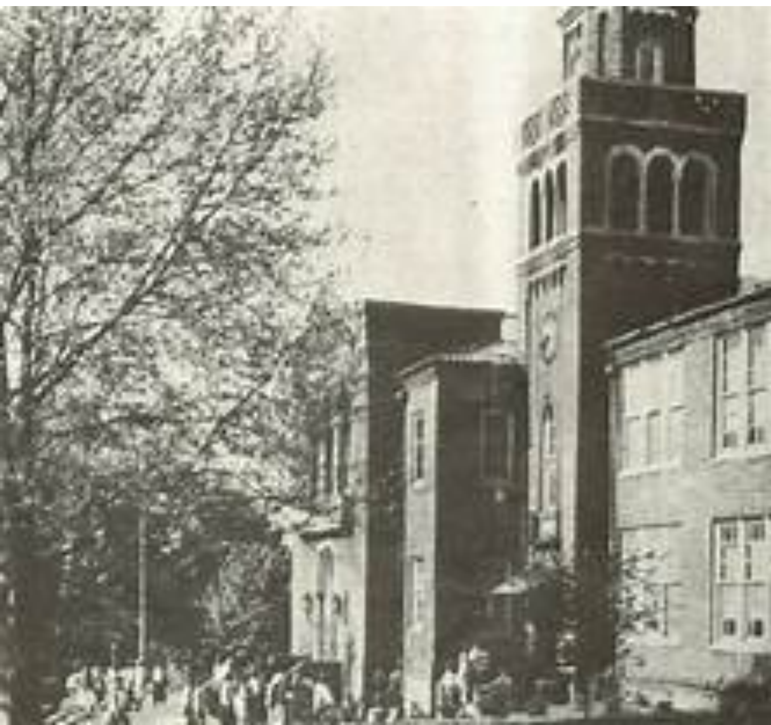
Lincoln School, Trenton