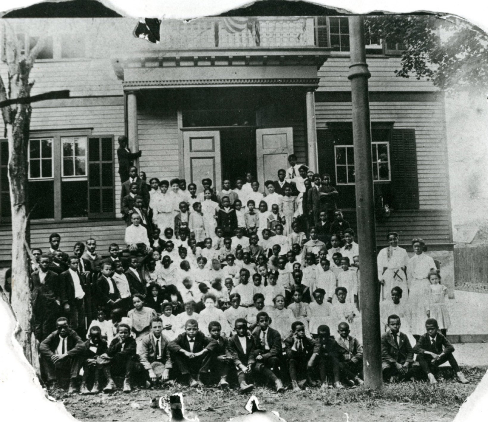
Witherspoon Street School students on the schoolhouse steps, 1903.